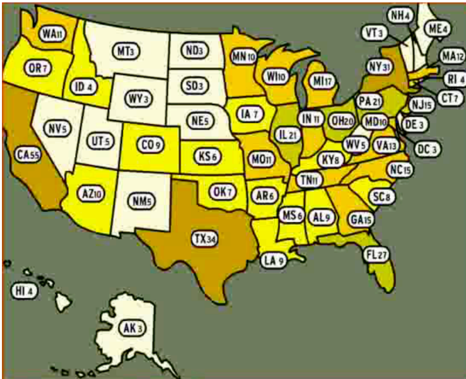
Electoral College Map for 2008

ND - Bismarck, North Dakota OH - Columbus, Ohio OK - Oklahoma City, Oklahoma OR - Salem, Oregon PA - Harrisburg, Pennsylvania RI - Providence, Rhode Island SC - Columbia, South Carolina SD - Pierre, South Dakota TN - Nashville, Tennessee TX - Austin, Texas UT - Salt Lake City, Utah VT - Montpelier, Vermont VA - Richmond, Virginia WA - Olympia, Washington WV - Charleston, West Virginia WI - Madison, Wisconsin WY - Cheyenne, Wyoming